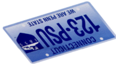
Penn State CT License Plates